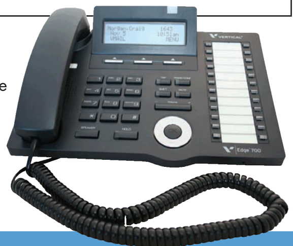
Edge 700 24 Button Phone

*Port estimates are based on standard IVR services. Port availability may vary based on services being used.